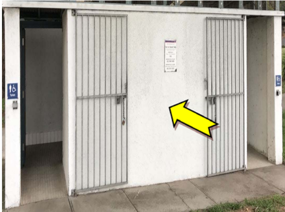
Photo 1. Exterior, throughout, wall - suspected lead-containing cream upper paint system.